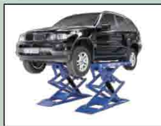
RLP35 with standard 300 mm (11 3/4") short ramps