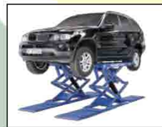
RLP35 with optional 1000 mm (39 3/8") long ramps